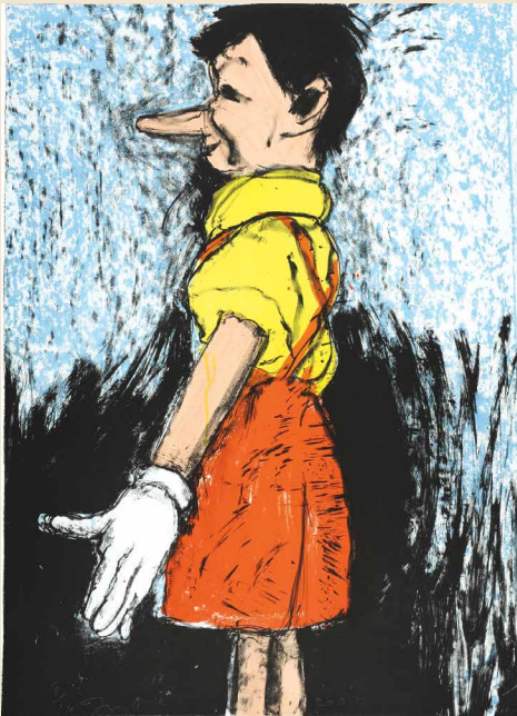
Jim Dine Various Martial Moves (detail) 2007 composite, four five-color lithographs 36 x 26 inches (each panel) edition of 16 Collaborating printers, Bill Lagattuta and Valpuri Kylmanen