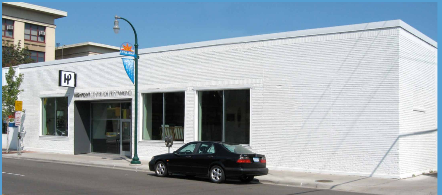
Above: Before for the HP2 project Below: After the HP2 project