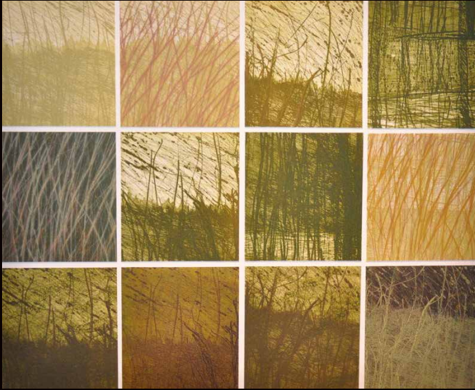
Pamela Carberry Red Forest Diary intaglio and collagraph 2010