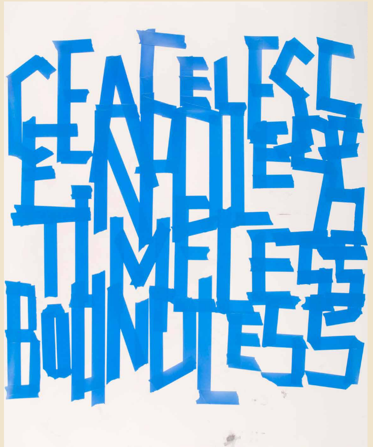
Todd Norsten Ceaseless, Endless, Timeless, Boundless lithography and screen printing edition of 11 2010